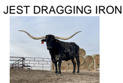
JEST DRAGGING IRON