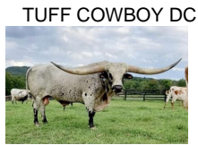
TUFF COWBOY DC